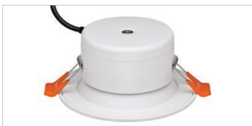
Supplied with rear heatsink cover for IC-F rating.