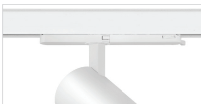
Concealed Track Mounted Driver