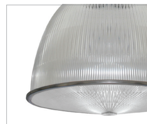
Prismatic Diffuser Option