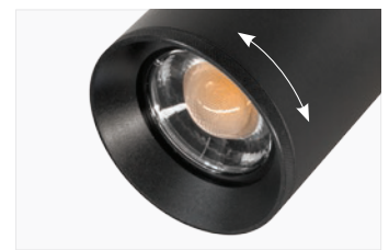
Rotatable front ring adjusts beam angles