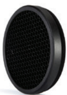
Optional: honeycomb lens