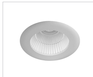
S Silver Trim