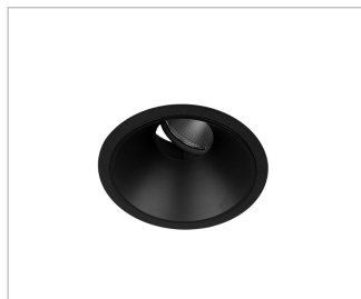
B Black Trim