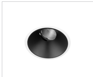
BI Black Insert