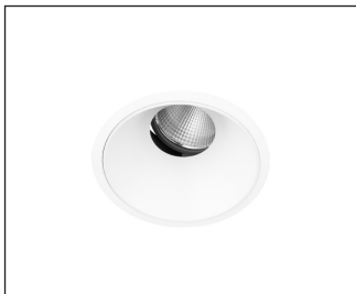
WI White Insert