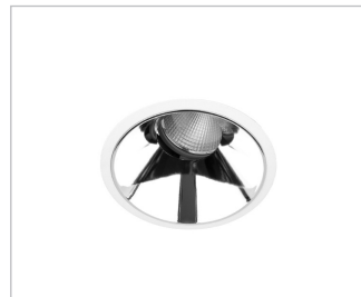
SI Silver Insert