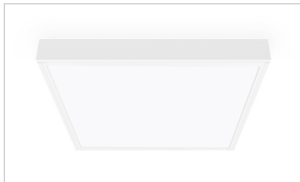
SM Surface Mounting Kit