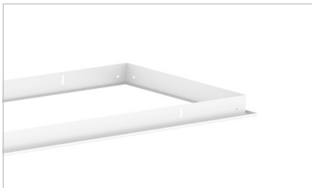
PR Plaster Recessing Kit