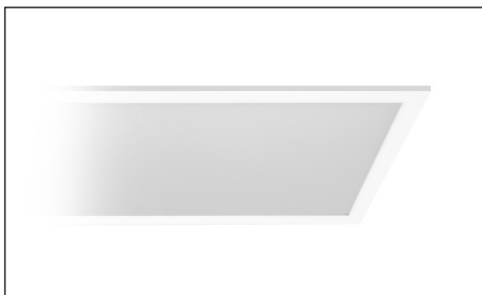
W White Trim