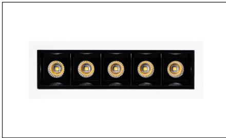
W White Trim