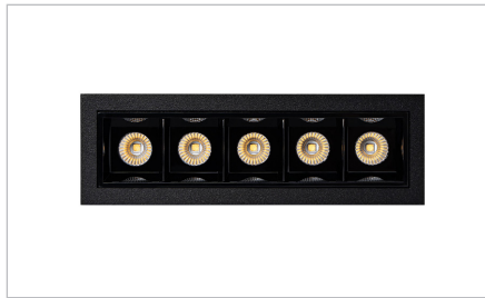
B Black Trim