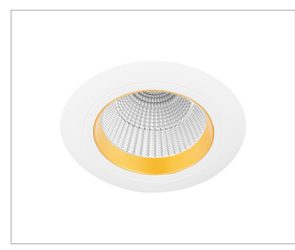
WI White Insert