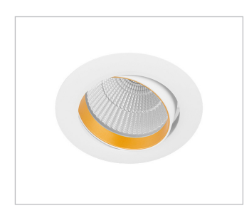
WI White Insert