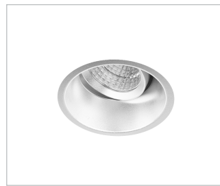
S Silver Trim