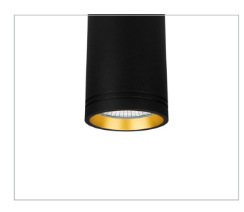
GI Gold Insert