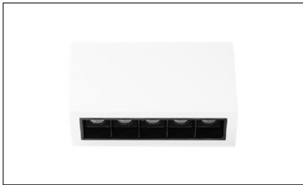
W White Trim