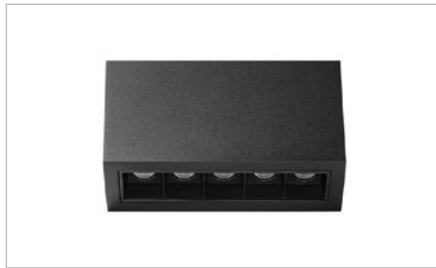
B Black Trim